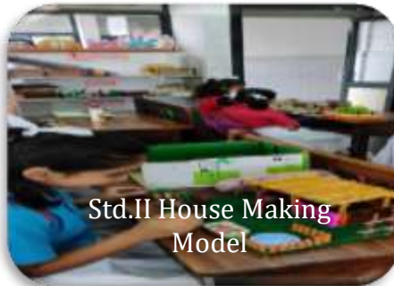
Std. II House Making Model