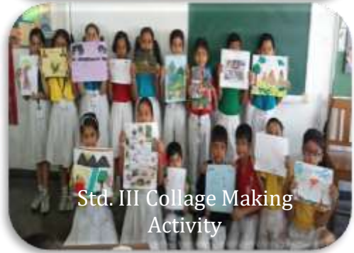
Std. III Collage Making Activity