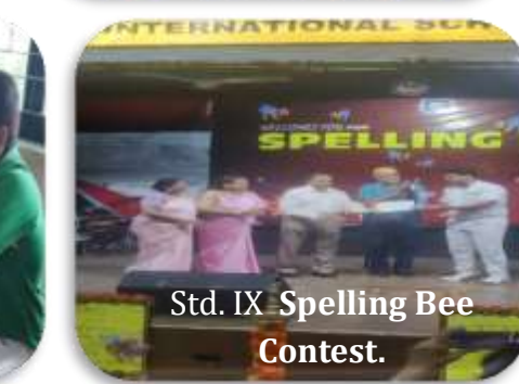
Std. IX Spelling Bee Contest.