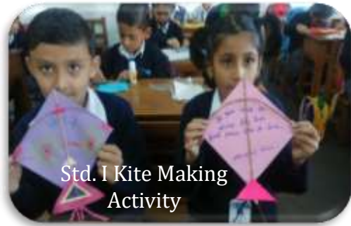
Std. I Kite Making Activity