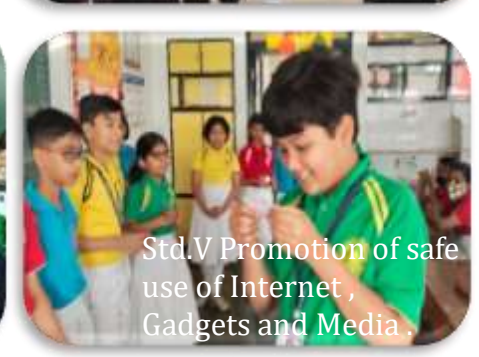
Std. V Promotion of safe use of Internet, Gadgets and Media.