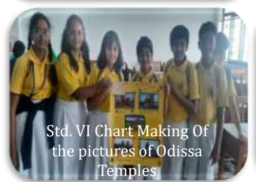
Std. VI Chart Making Of the pictures of Odissa Temples