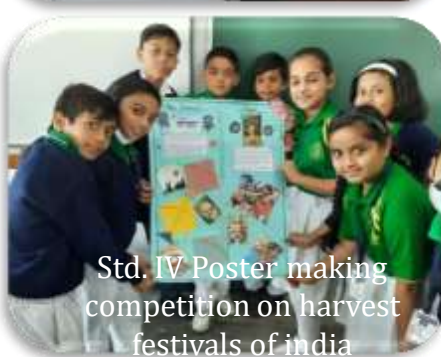
Std. IV Poster making competition on harvest festivals of india