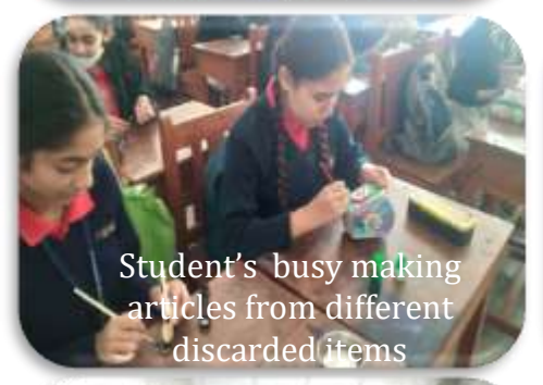
Student's busy making aricles from different discarded items