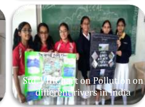
Std. VIII Chart on Pollution on different rivers in india