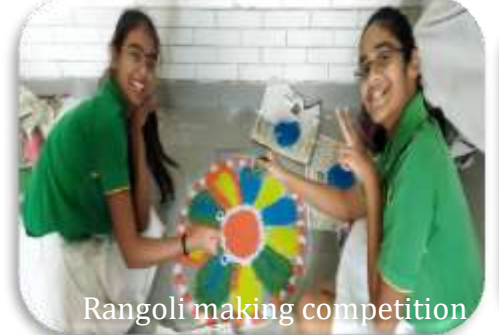
Rangoli making competition