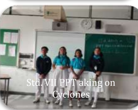
Std. VII PPT aking on Cyclones