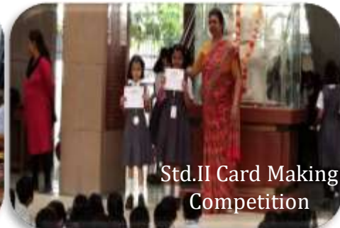
Std. II Card Making Competition