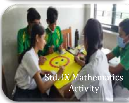
Std. IX Mathematics Activity