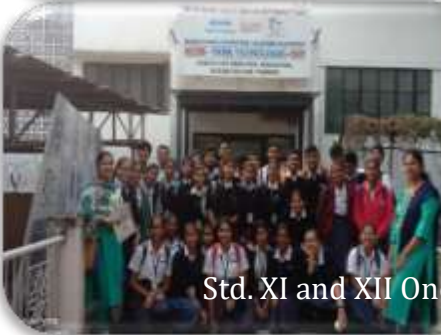
Std. XI and XII One Day workshop at RCIIT